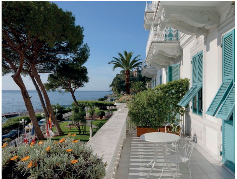
Grand Hotel Miramare, Santa Margherita

Grand Hotel Miramare in Santa Margherita is a 5-star built in Art Nouveau style, with distinctive blue-green shutters, in a park of palms and Mediterranean flowers overlooking the sea. There are 78 rooms and suites, some with balconies and many with sea view. Stucco work and wooden floors have been restored and together with pastel shades of furnishings, the tone is restrained and elegant. The seawater swimming pool is in the grounds and there is a public beach just below the hotel.