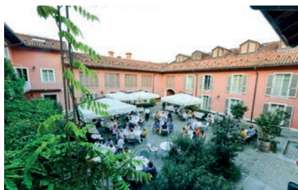
Villa d'Amelia, Benevello