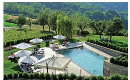
Villa d'Amelia, Benevello