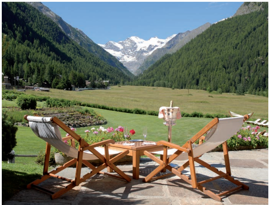
Hotel Bellevue, Cogne

Hotel Bellevue in Cogne is a Relais & Chateaux hotel located in the Gran Paradiso National Park, ideal for a relaxing stay in the Italian Alps or as part of a touring holiday. The hotel has the feel of an elegant, historic alpine chalet. You will enjoy getting out and about amongst the fabulous scenery and could opt for a guided walk, horse-riding, cycling or fishing. Back at the Hotel Bellevue, relax in the sauna and swimming pool or have a soothing massage.